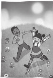
1. It's sunny .

2. Look at the pictures. Write the correct weather words from Exercise 1.