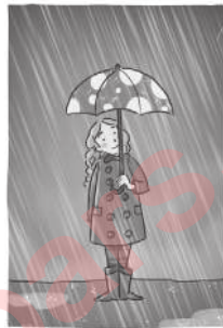
2. It's _____.