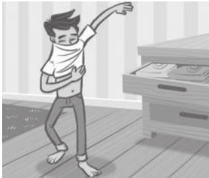
1. get dressed

brush my teeth comb / brush my hair come home exercise hang out with friends get dressed get undressed get up go to bed go to school relax take a bath / shower