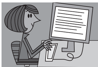
1. computer programmer