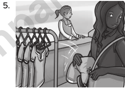
The woman _____ a blouse.