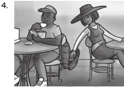
A woman _____ the man's phone.