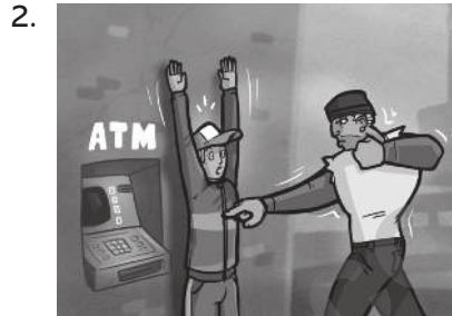
Someone _____ a man at an ATM.