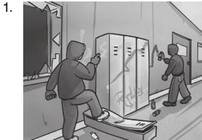
Some kids are vandalizing someone's home.