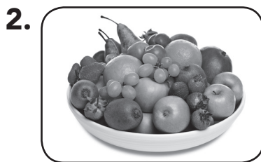
fruit ice cream