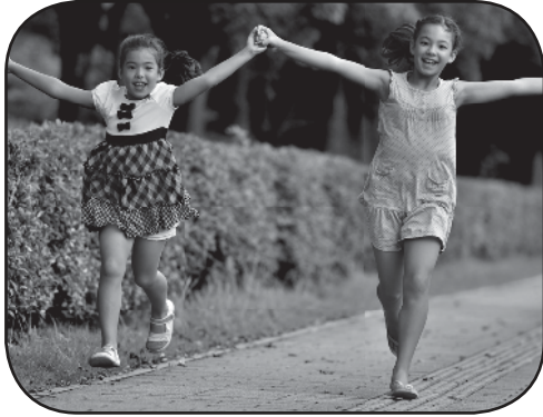
1. They _____ jumping.