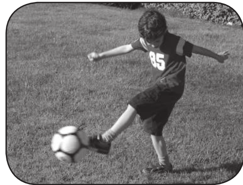
4. He _____ running.