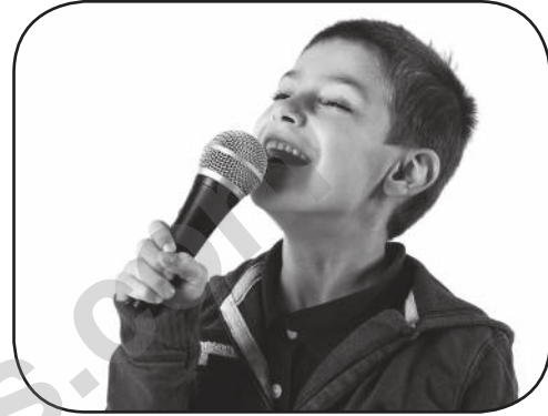
2. He _____ singing.