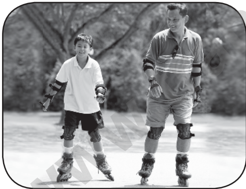
3. They _____ skating.